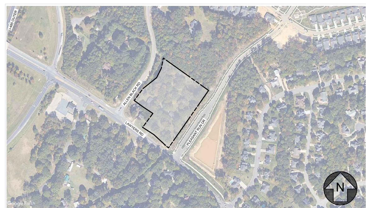
SITE DATA TABLE