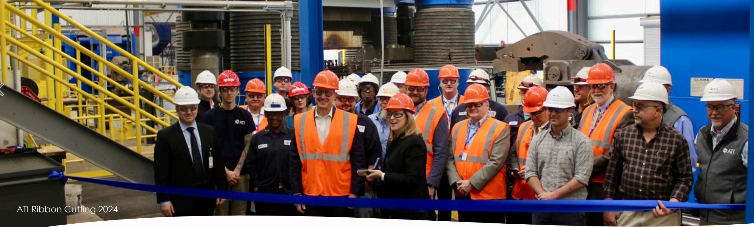
ATI Ribbon Cutting 2024