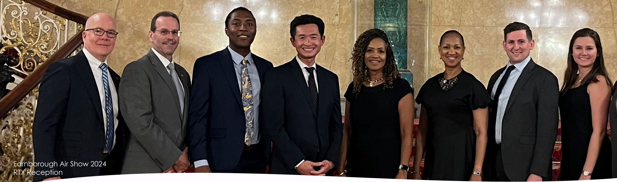
Farnborough Air Show 2024 RTX Reception