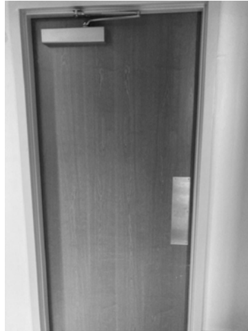
FSA Office Side of Door