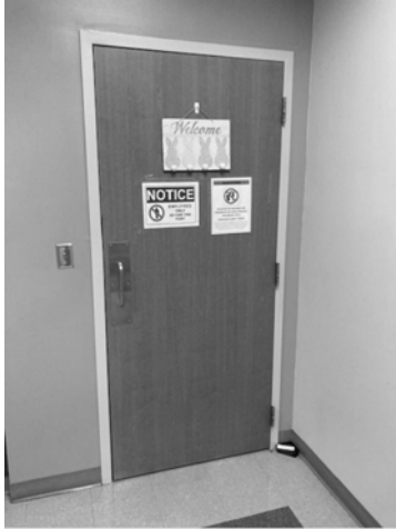
Lobby Side of Door